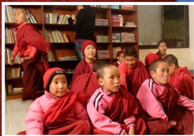
Library in Arya Tara School, Nepal.

The most important problem that must be solved is the lack of a suitable room for a library in the BCH complex.