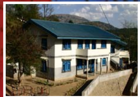
New houses in 2006.

Children of BCH attend the local Central School for Tibetans, which has 10 grades and is located next to BCH's premises. However, completing a secondary education or reaching a higher education is possible only outside of Dolanji and is fully dependent upon support of the child by private sponsors. For those most talented children without a private sponsor, BCH tries to pay for the costs of higher education from general donations.