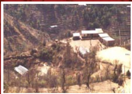
BCH and school in Dolanji, 2000.